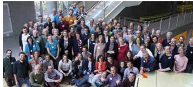
International Delegates Assembly 2019 in Stuttgart, Germany.